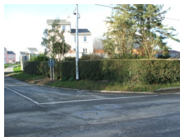
New Sheetlend Road footpath and improve- ment works complete

The Safety Measures at Beaulieu & Newtown- stalaban Cross are now complete and have been widely welcomed by road users. This is the 4th time that I have been successful in having improvement works carried out at these two dangerous junction over the last 14 years.