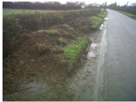
Sheetland Road before major upgrade